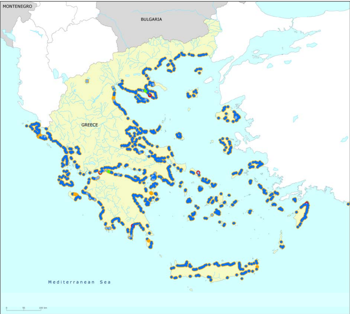
Map 1: Bathing waters reported during the 2011 bathing season in Greece